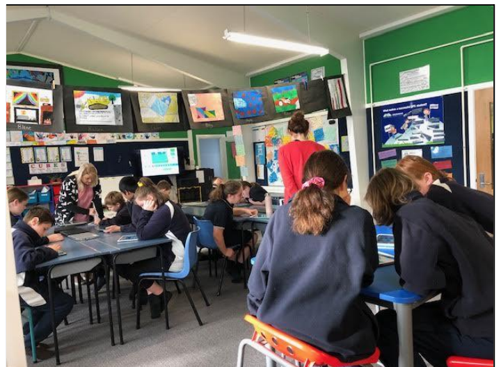
Ruma Maunga working on their Coding skills